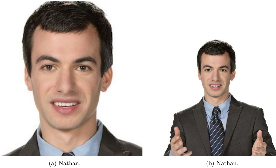
Figure 2: Nathan from Nathan for You.